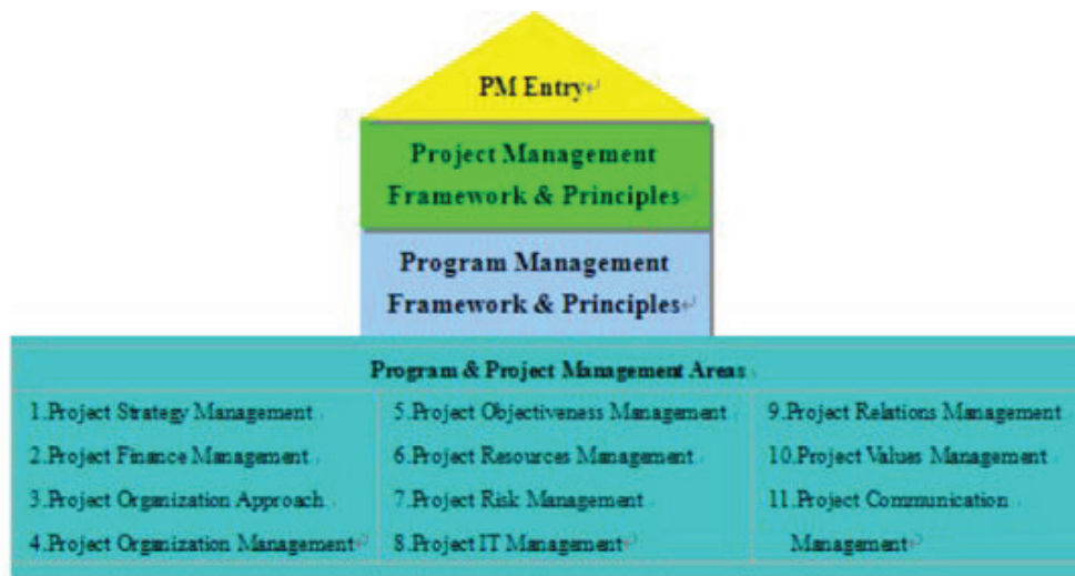
FIGURE 2. P2M [22]

In contrast, SCRUM generates usually scope creep and lives with it because there are a regular and repeated changes on the scope by the stakeholders through process called a sprint which start by asking for changes or adding more requirements on the scope after the project start [8]. Simply, its main concern to start the development and it is a framework for developing and sustaining complex products [19]. International Project Management Association Competence Baseline (ICB) sets a quality standards and requirements as baseline to achieve and fulfil the project deliverables (scope) within time frame and cost controlled operation [20]. The scope in ICB indicated in execution phase with no specific procedures as scope management [20]. However, in Project & Program Management P2M the part which heighted the scope manage is Project Objectives/ Goal Management which concerns with meeting or exceed stakeholders satisfaction by attaining scope and quality within time and budget [21].