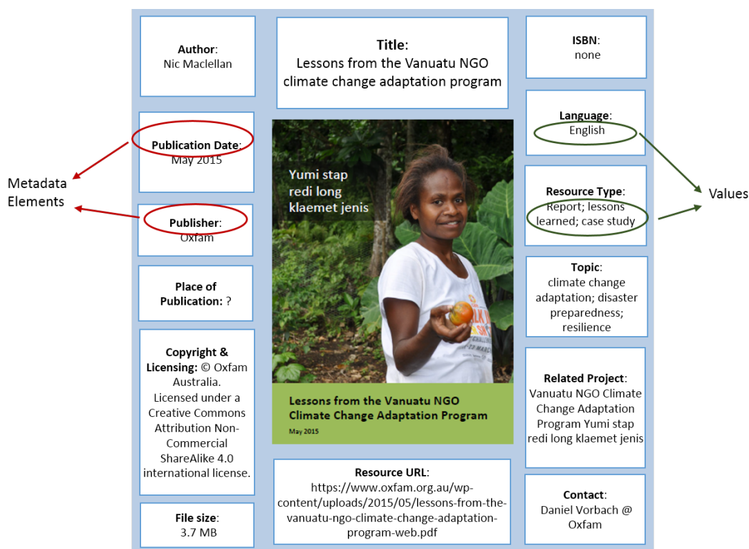
Figure 1: An example of a metadata set for a document, showing elements and values.

As an example, the figure below shows a document, surrounded by a set of descriptive metadata. The metadata consists of elements and values . The metadata schema in use here would include a list of the elements, plus some instructions on how to fill out the values.